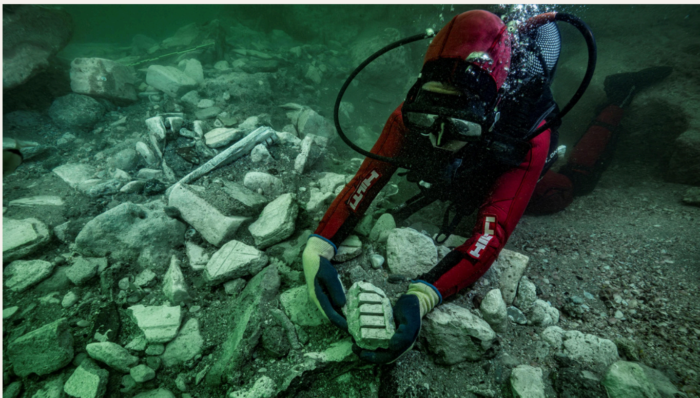
Architectual elements of the temple to Isis.

The discoveries are due to the fact that parts of the temple collapsed into the harbour during the earthquake and these remains were protected from the clearing up and removal of the ruins that remained on land.